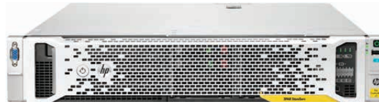
HPE 3PAR StoreServ File Controller v3

HPE 3PAR StoreServ File Controllers effectively serve thousands of concurrent users and multiple diverse workloads with autonomic space reclamation when files are deleted, non-intrusive sub file deduplication, and support for storage federation services. A range of encryption options, sophisticated data access controls for Microsoft Active Directory-based IT environments, and the ability to run endpoint protection and backup software onboard protects your data and your organization. This bulletproof protection is further enhanced by clustering HPE 3PAR StoreServ File Controllers for transparent failover and online rolling maintenance updates so that users can always access their data. Visit hp.com/go/3PAR/FileController .