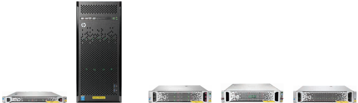
HPE StoreEasy 1450 Storage