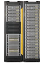
HPE 3PAR StoreServ 20000 Storage